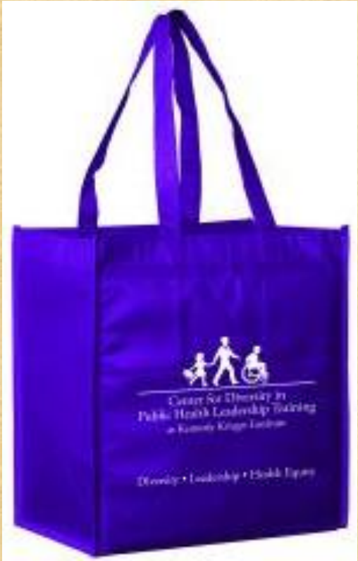
Kennedy Krieger Institute Tote Bag