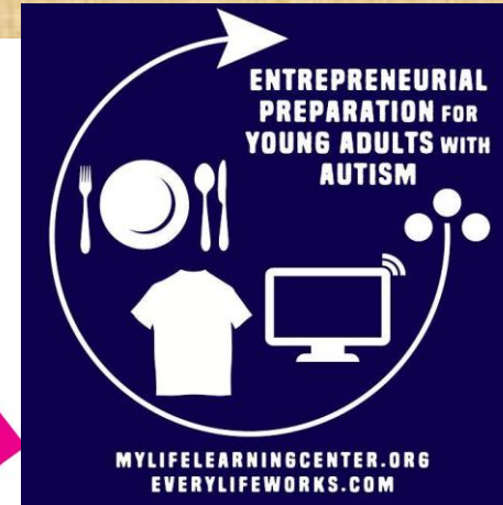
Blue on white t shirt