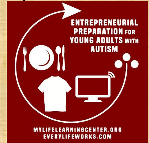
White on maroon shirt