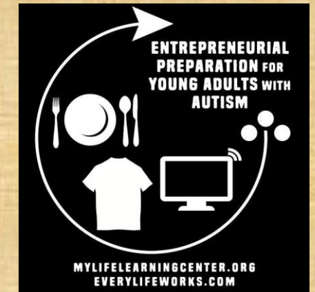
White on black t shirt

Please let us know if you would like a custom color!