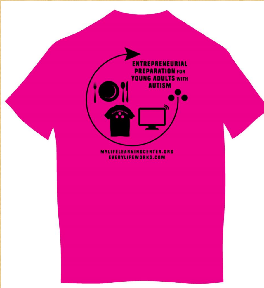
Black on pink t shirt